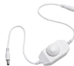
TBD.ILD In-line Dimmer (Sold Separately)